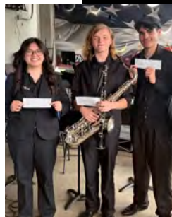
La Serna Scholarships