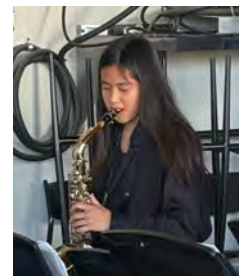
Mission Viejo Winner