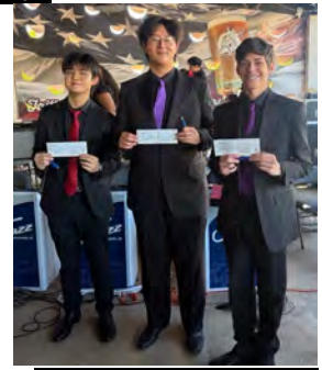
Trabuco Hills Winners