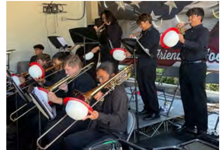
Oxford Academy Jazz Band