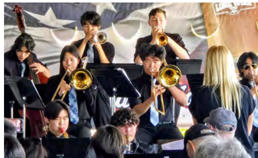
Northwood Jazz Band