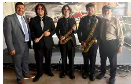
Yorba Linda Scholarship Winners