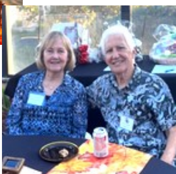
More photos on page 2.