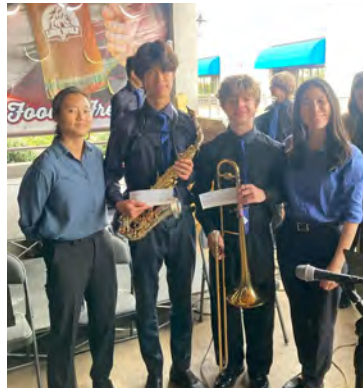
University Scholarship Winners