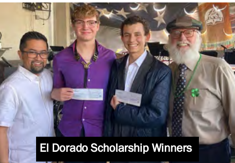
El Dorado Scholarship Winners