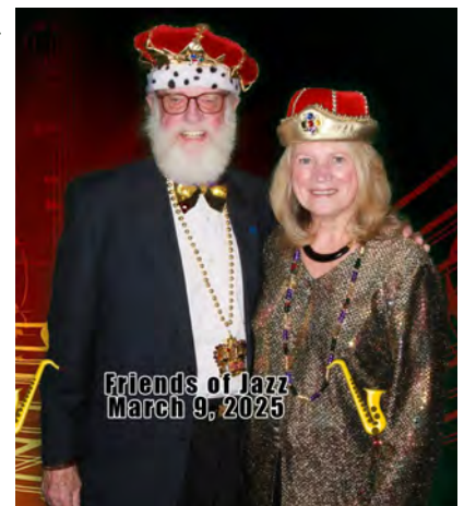
Friends of Jazz March 9, 2025

Friends of Jazz Spring Jazz Party Saturday, May 17 5-8pm Fullerton Elks Lodge Info: 714.525.6669