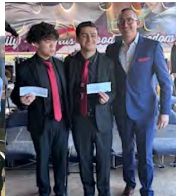
Esperanza Scholarship Winners