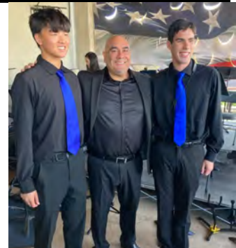
Valencia Scholarship Winners