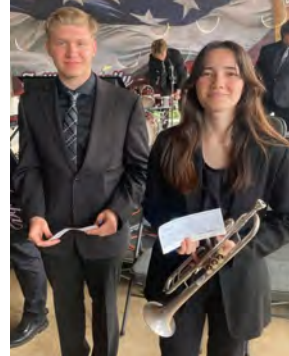
Yorba Linda Scholarship Winners