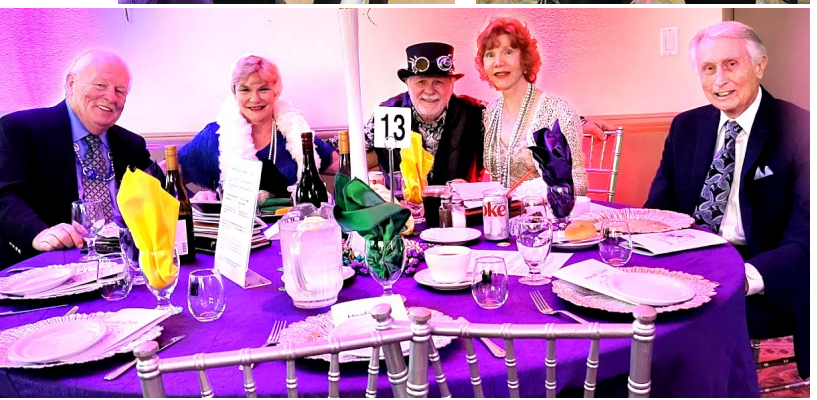
If you'd like to join FOJ or want to know more about us and upcoming events, check out our website: www.friendsofjazzinc.com.

continued on page 4