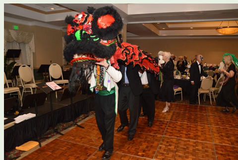
MARDI GRAS BALL MEMORIES