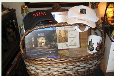
Above: Items from the Musical Instrument Museum in Phoenix, AZ, including "A Journey Through the Musical Instrument Museum" (deluxe book), coffee mug, and MIM and FOJ baseball caps.