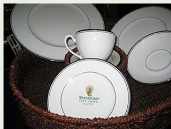
Above left: Set of classic Waterford fine China dinner plates, coffee cups and more. Top center: 15 items from the Mystic Hills Vineyard in San Miguel, including three bottles of red wine, two wine glasses, and one wine and cheese pairing for six. Right: Angels merchandise & gift items, including two tee-shirts, blanket, coffee mug, rally monkey and Vladimir Guerrero bobblehead. Lower left: "Paris" items: "Paris" quilt, Eiffel Tower metal sculpture, mugs, bottle of wine. Center: Crustacean ceramics (crab- and lobster-themed bowls and more). Below right: Whale Watching Day at the Beach: Whale Watching (Newport Landing) gift certificate, sandpiper, seal, fish, and beach-themed plate. Lower right corner: Assorted vintage wine collection.