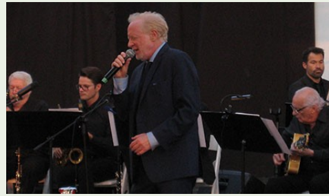
Don Most: from "Happy Days" to Muck stage