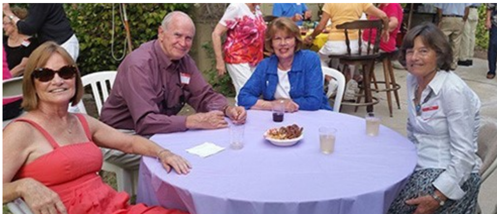
The annual Friends of Jazz Members Party is among FOJ's most popular events, giving members a chance to socialize.

First off is the pride you can take in being part of the community more than just in name only. Every time you see, hear or read about a success story – a youngster who went on to accomplish more in the world of music, whether as