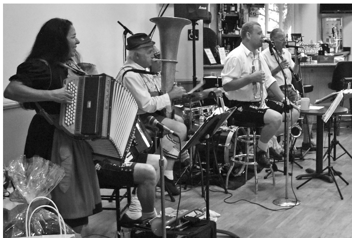
GENUINE ALPINE MUSIC made all the difference at this year's Oktoberfest dinner-dance party, held Oct. 25 at the Elks Lodge.