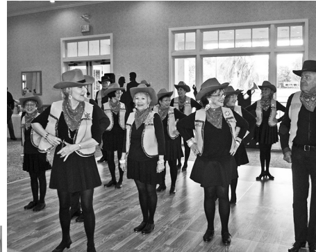
Above: OLLI's Snappy Tappers exhibit their fancy footwork.